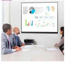
Big screen office