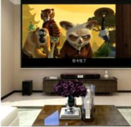
Living room movie